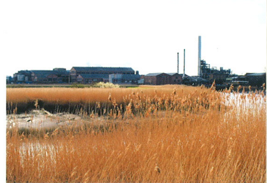
Top: Swale Skills Centre in Sittingbourne