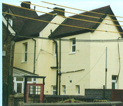
Before and after photos of a residence in Queenborough that has benefitted from external wall insulation